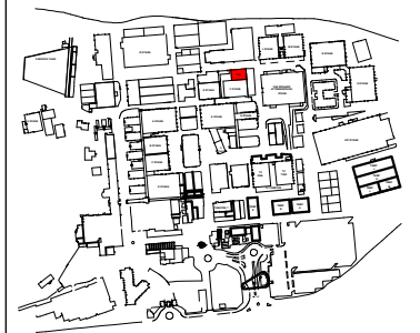
PINEWOOD STUDIOS SITE PLAN

ALL DIMENSIONS TO BE CHECKED ON SITE PRIOR TO ANY COMMENCEMENT OF WORKS